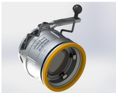
API RF 1004 Coupler